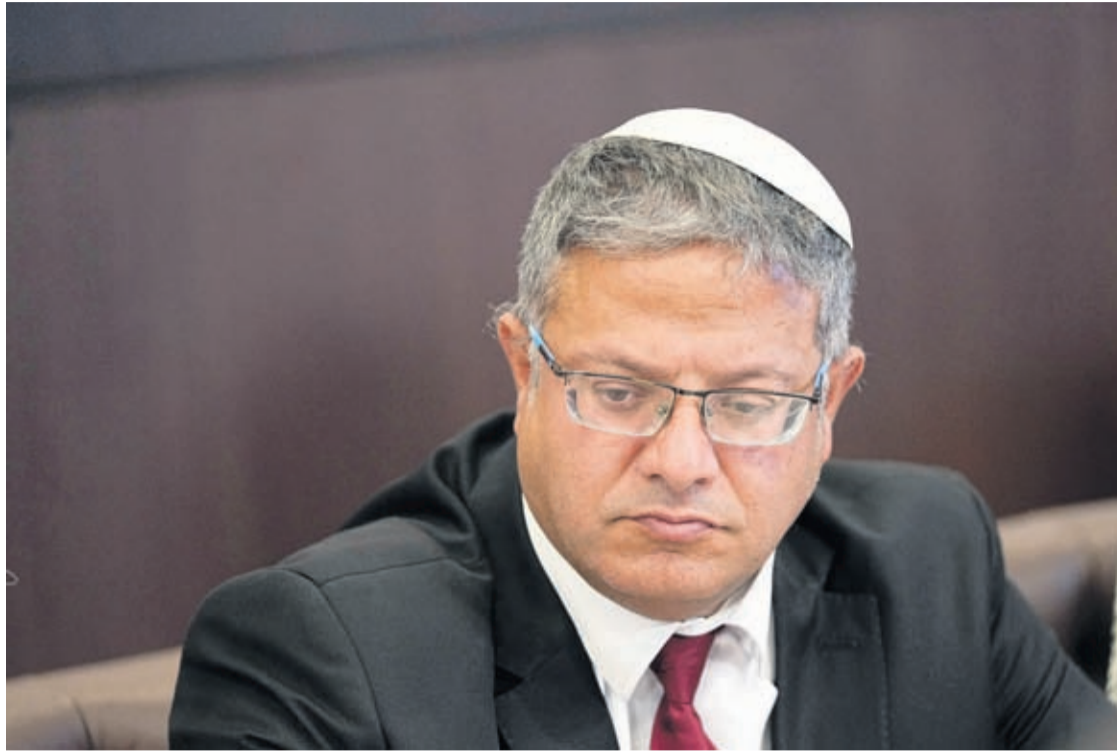
Israel's National Security Minister Itamar Ben-Gvir attends the weekly cabinet meeting in Jerusalem, Sunday, Sept. 10, 2023.

The plan was foiled by Israeli intelligence officials, the Shin Bet said, without offering evidence.